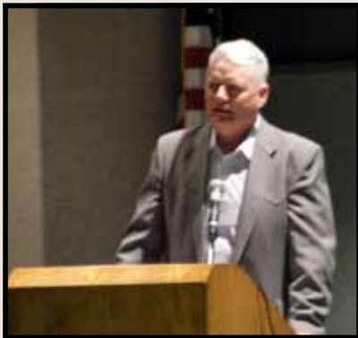
2011 AZRDC Rural Policy Forum