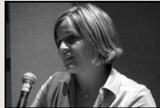
2011 AZRDC Rural Policy Forum