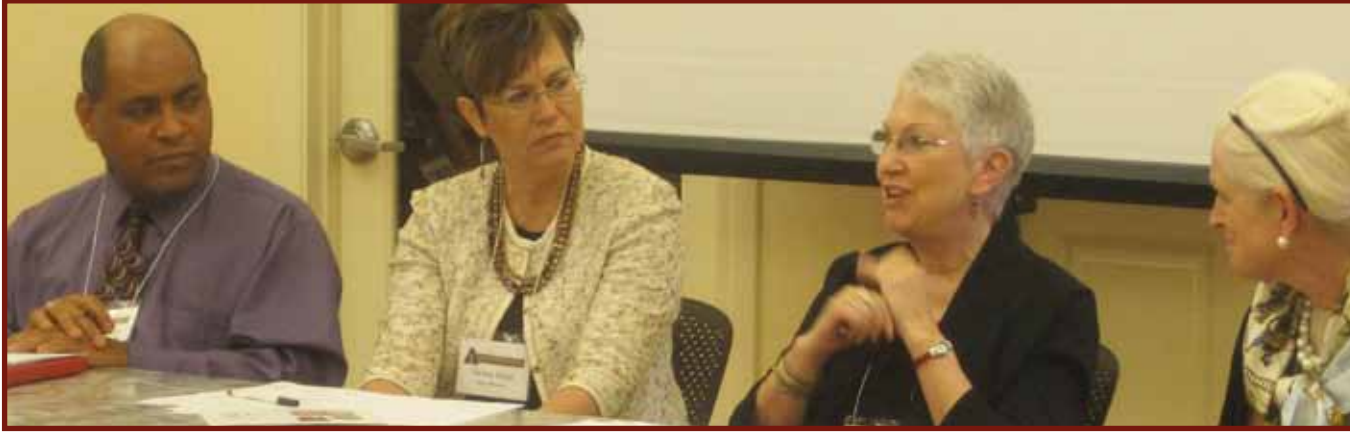
AGF Member panel talks place-based philanthropy